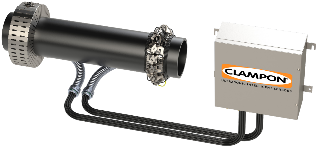
ClampOn Topside CEM ® Corrosion-Erosion Monitor