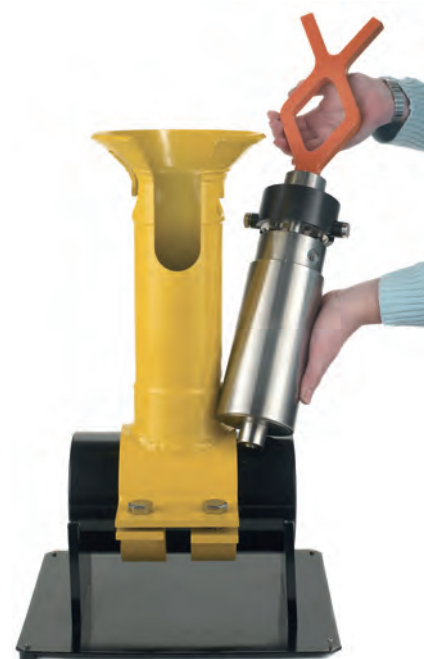
Subsea version of the ClampOn DSP Leak Monitor.

The basic theory is that a leak creates a very high-frequency noise that can be monitored by an ultrasonic sensor. In a «non-leak» situation the ultrasonic pattern will be stable, but when a leak occurs the signature will change drastically. The ClampOn DSP Leak Monitor is based on the ClampOn Ultrasonic Intelligent Sensor technology platform. The instrument's ability to monitor signal at multiple frequency, combined with extreme sensitivity enables it to distin-