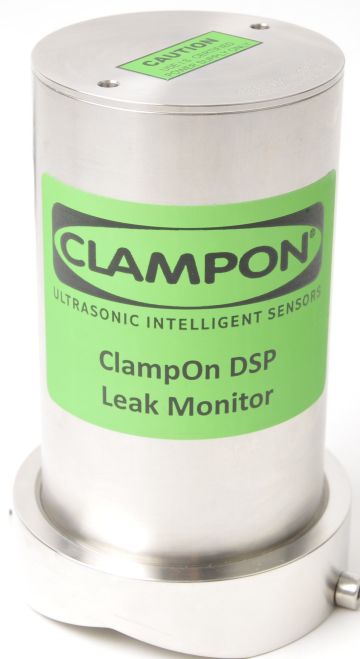
ClampOn DSP Leak Monitor Ex ia version.