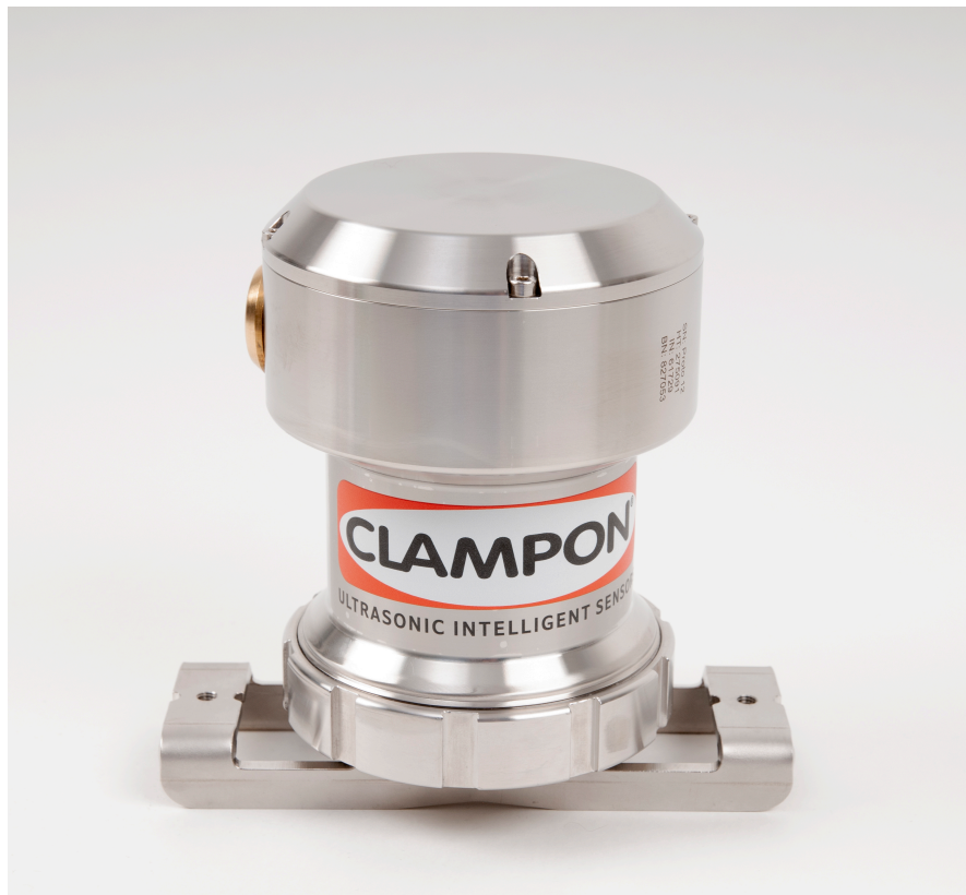
ClampOn DSP Leak Monitor Ex d version