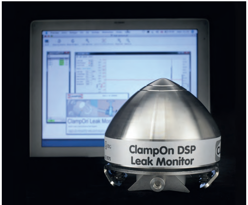
Data from the sensor can be displayed on PC or interfaced with control system.