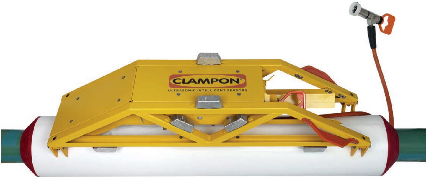
Spool piece with pre-installed ClampOn CEM ® with ROV-installable/retrievable electronics.