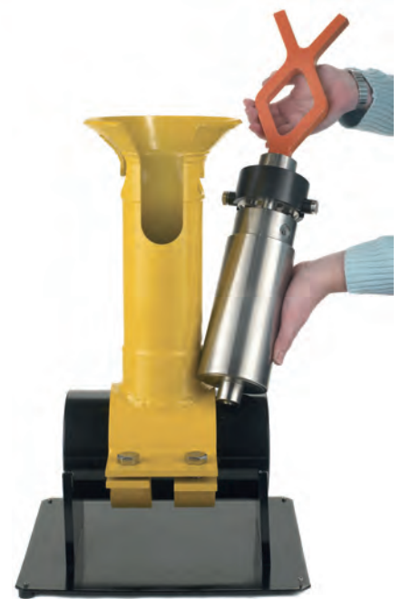
Subsea version of the ClampOn DSP Leak Monitor.

The basic theory is that a leak creates a very high-frequency noise that can be monitored by an ultrasonic sensor. In a «non-leak» situation the ultrasonic pattern will be stable, but when a leak occurs the signature will change drastically. The ClampOn DSP Leak Monitor is based on the ClampOn Ultrasonic Intelligent Sensor technology platform. The instrument's ability to monitor signal at multiple frequency, combined with extreme sensitivity enables it to distin-