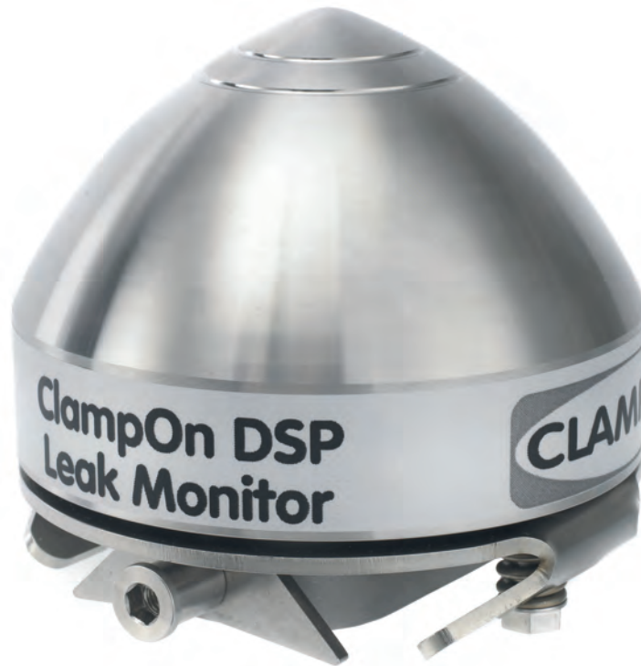
ClampOn DSP Leak Monitor Ex ia version.